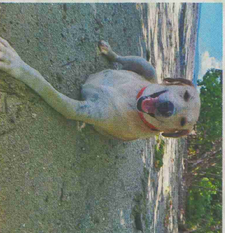
Leo on the beach enjoying a full and happy life.